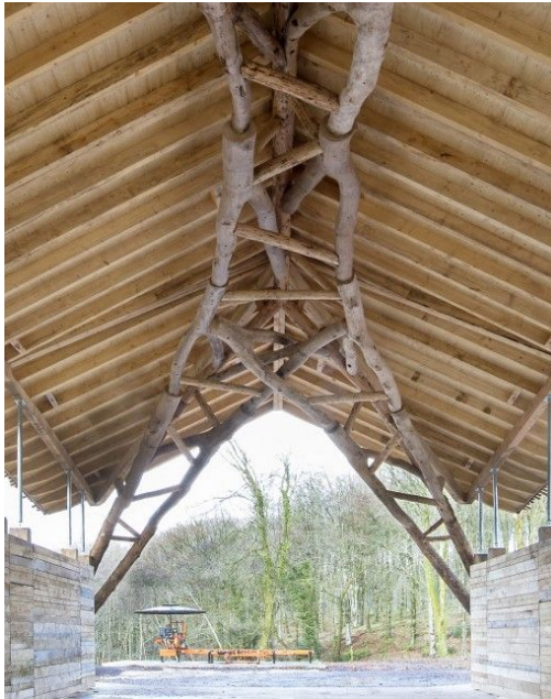
Woodchip Barn, Hooke Park.